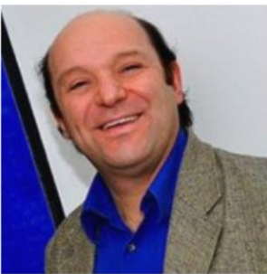
Leonardo Vazquez National Center for Creative Placemaking

Although the agenda for State Association is multi-faceted, current priorities include programs and services for senior citizens, building the capacity of nonprofits by reducing state bureaucracy and red tape and participation, homeland security and community safety, initiatives to combat poverty and supporting the NJ-Israel relationship. Advocacy on Federal issues include nutrition programs, nonprofit security grants, health care and human rights.